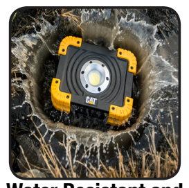
Water Resistant and Bumper Protected