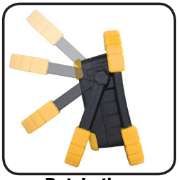
Ratcheting Stand and Handle